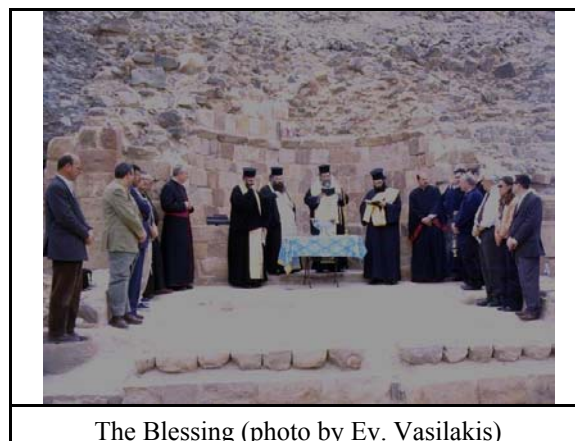
The Blessing